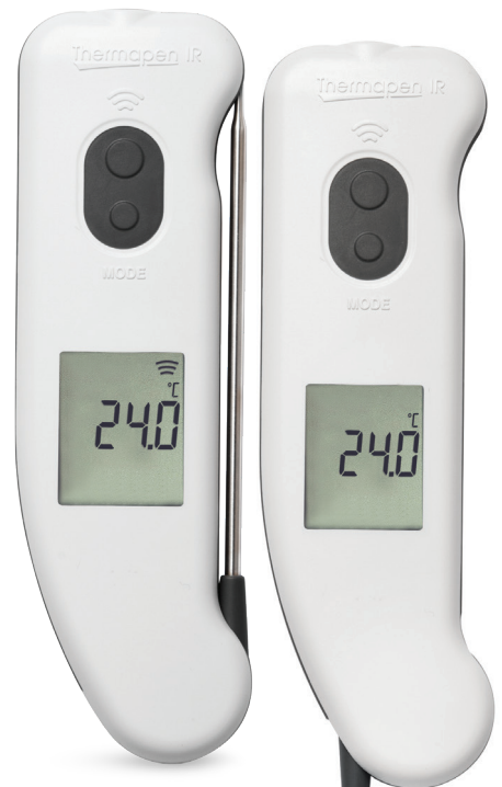
Thermapen IR with air probe (228-114)

Opening the probe puts the instrument into probe mode, enabling you to take liquid or the core temperature of semi-solid food products using the fast response, stainless steel penetration probe (Ø3.3 x 110 mm). Displaying the temperature in just 3 seconds. The probe conveniently folds back through 180° into the side of the instrument when not in use.