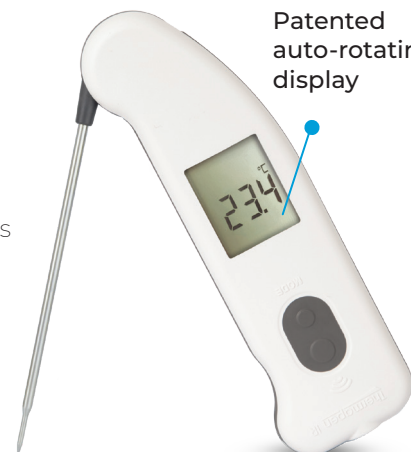
Patented auto-rotating display