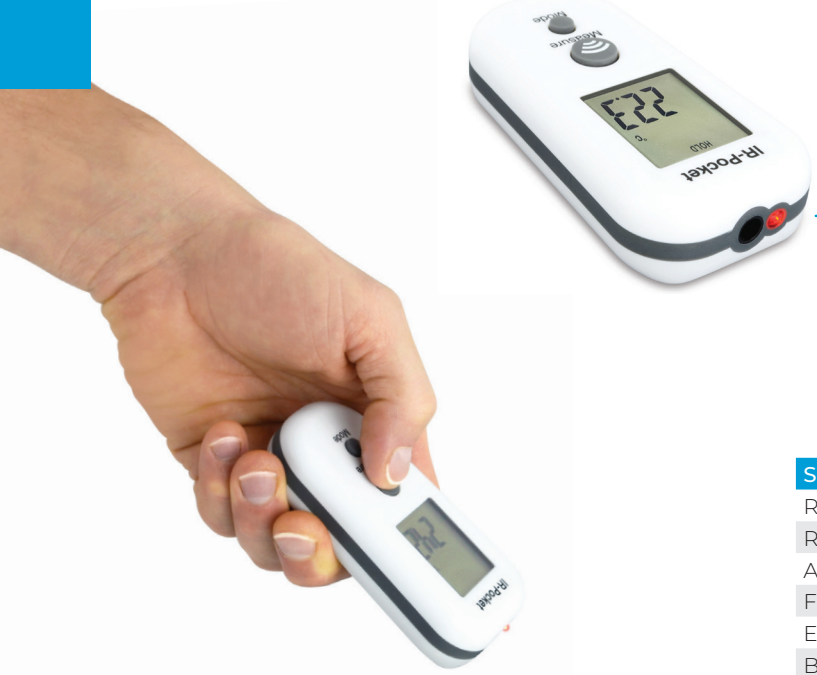
● LED pointer

The unit incorporates LED spot alignment, which allows the user to precisely target the diameter of the area to be measured. The LED pointer is safer for the eyes than laser pointers. As you move closer or further from the target the LED spot changes diameter indicating the area being measured.