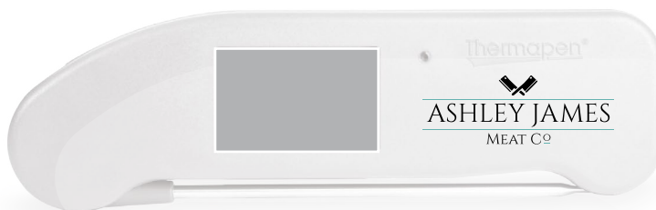
CUSTOMER > ASHLEY JAMES MEAT CO. Logo only design