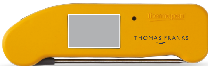
CUSTOMER > THOMAS FRANKS Logo only design