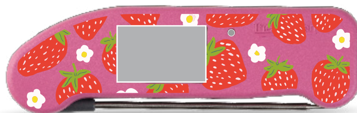
CUSTOMER > LAURA BARNES Full case design