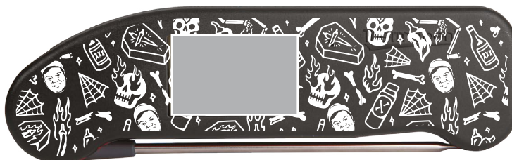
CUSTOMER > TUBBY TOMS Full case design