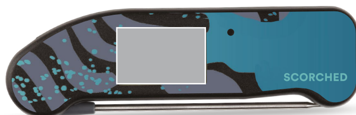
CUSTOMER > GENEVIEVE TAYLOR Full case design with logo